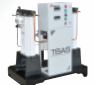
Medical Dryer 10 to 200 cfm