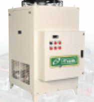
Refrigeration Chillers 0.5 to 50 TR