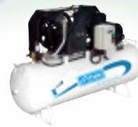
Oilfree Air Compressor 0.75 to 20 HP