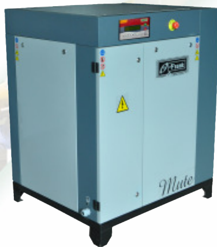
Jumbo 15 to HD 40