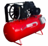
Belt Driven Compressor 1 to 30 HP