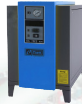
Oilfree Scroll Compressor 3 to 30 HP