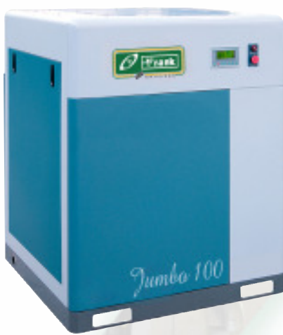
Jumbo HD 50 - 125

The drive between the airend and electric motor is carried out by means of gearless direct coupling connection. One to one direct drive by maintenance free coupling reduces number of components needed in gear drive, increasing reliability and service life through elimination of wear & transmission loses. Low speed 2950 RPM larger airends are more efficient than high speed airends. A dedicated airend for any machine at any pressure in order to grant maximum performance in the complete range.