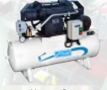
Vacuum Pump 1 to 10 HP